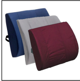
A lumbar support pillow is a good way to add support to your low back while at work

Sitting posture is an important factor in both your health and performance in the workplace. By sitting correctly, you are able to achieve many benefits for your body, including preventing your spine from becoming fixated in abnormal positions.