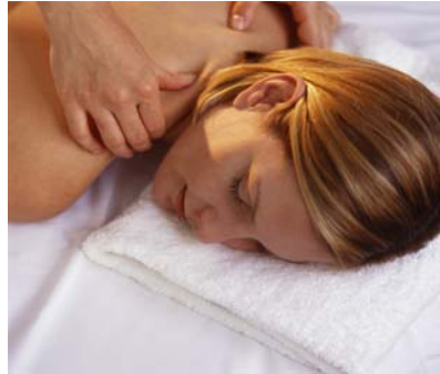
Relax and de-stress with a regular regimen of massage

A few conditions that can benefit from massage include: